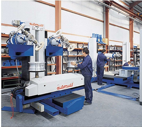
CNC polishing machine model HD-II with 2 double working heads, equipped with 2 piece holding spindles to allow 2 parts to be simultaneously finished