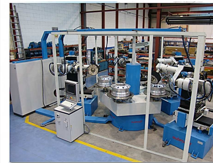
4 CNC head rotary transfer polishing machine with 21 interpolated axes for external polishing of aluminium alloy truck wheels