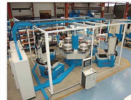
5 CNC head rotary transfer polishing machine with 26 interpolated axes for internal polishing of aluminium alloy truck wheels.