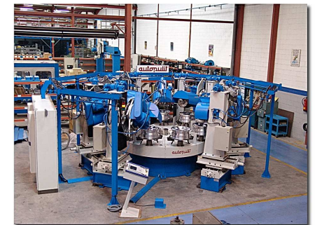
8 head automatic rotary transfer polishing machine for aluminium alloy wheels