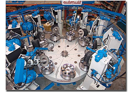
8 head automatic rotary transfer polishing machine for aluminium alloy wheels