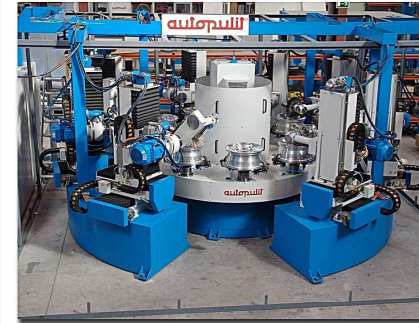
8 CNC head rotary transfer machine with 42 interpolated axes for polishing aluminium alloy wheels